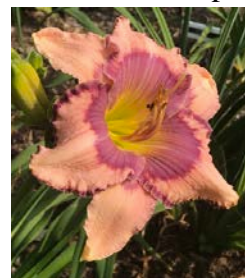
Angels in Wisconsin