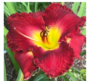
Carolina Christmas