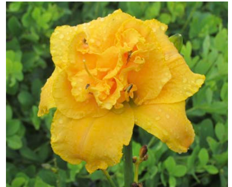
Single Bloom of Indecisive by Genni