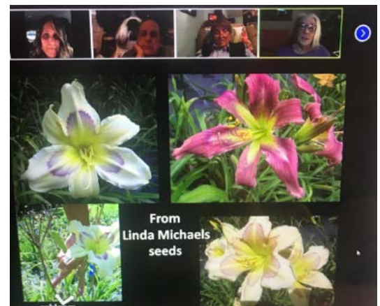
Screen Shot from Carole's program