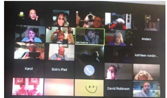
Screen Shot of one page of attendees