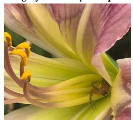
Spider hiding in a Carole Hunter seedling