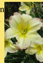
H. Elegant Edgings at On Eagle's Wings Garden