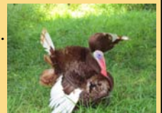
My Turkey Friend