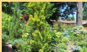
The Weber Garden

Our next stopped surprised me probably the most of the whole trip. The home of Mike and Susan Weber was a true gem. There were not very many daylilies at this garden, but they were sprinkled in appropriately. The thing about this garden was that it was a celebration of individual species of different trees, shrubs, and plants. There were very unique plantings that I have never seen before. Such an incredible and vast collection of unique forms.