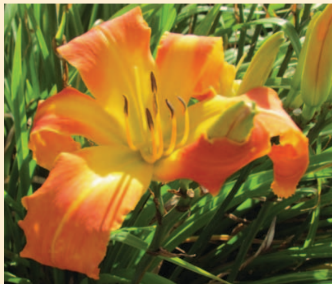
H. Orange Clown

Note-Average meeting times will be 2-2 1/2 hours. The Annual meeting tends to run longer than that.