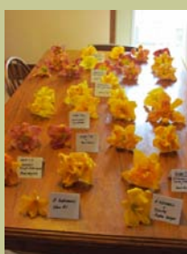
Kathy's living display showing generations

After treats, Kathy continued to treat us with her amazing living display of her hybridizing program. The way she laid out her display was informative and beautiful. She explained how she began using species daylilies. Then through many generations of crosses she shared the growth and change of these species daylilies to something quite remarkable. We were then able to tour her garden which included many varieties of new daylilies as well as historic ones. Her seedlings were very impressive as well. She used companion plants beautifully as well.