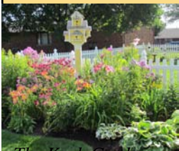
The Koch Garden

Upon our arrival and registration at the regional, we were in for a treat with an accredited exhibition display. We were able to see how the flowers were judged on-scape and able to ask questions of the exhibition judges. It was very interesting and educational.