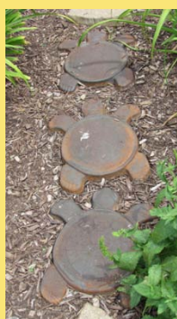
Fun elements at Ever-Changing Garden

The day wasn't over though. We all were able to attend a workshop dedicated to future hosts of the national. Lots of notes were taken for sure! Also the evening festivities concluded with national convention awards and our very own AHS president was crowned a Kentucky Colonel!