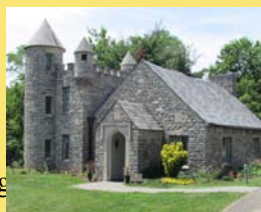
Castle at Yew Dell