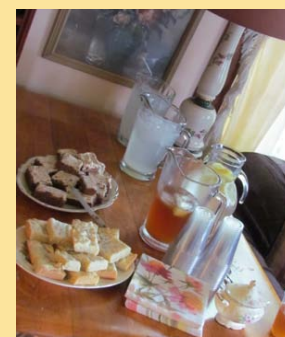
Almond Bars front left

Cream margarine, butter, and sugar. Add eggs and mix. Microwave almond paste for 15 seconds and add to the mixture. Stir in flour. Put into greased 9 X 13 pan. Sprinkle with sugar over the top. Bake at 350 degrees for 30 minutes. You can also top with sliced almonds.