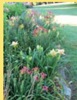
Mimosa Trees and beautiful daylilies at