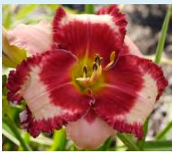
Take the Red Eye

Stuart's first hybridizing concentrated on red borders and recurved flowers. He has since decided that flat flowers show off edges better and is improving on flower shape.