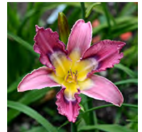
H. ‘Spring Heather’

Some more good news: David’s very good friend, Eric Simpson’s Cavalier Gardens is one of the gardens we will visit on the Region 2 Summer Meeting bus tour. Eric has showcased David’s plants in a bed of their own - a chance to see those stars, hopefully, in full bloom!