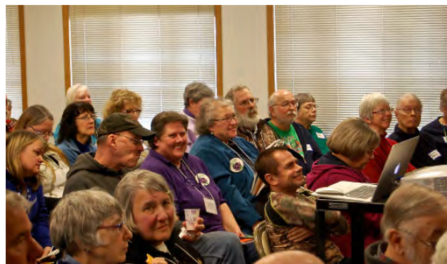
Happy faces, happy people !That must have been a beautiful picture on the screen!