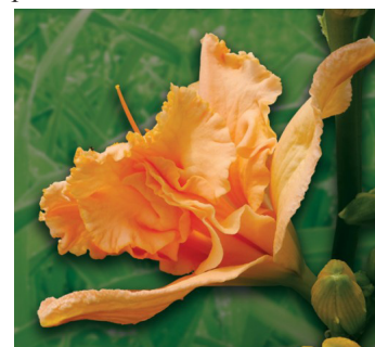
H. 'Van Gogh's Ear', an example of Curt's hybridizing passion for sculptured forms.