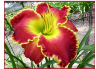
H. Yuletide Magic