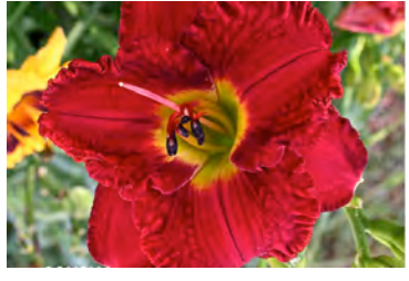
H. Christmas Wishes