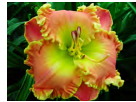
H. 'Kennesaw Mountain Hayride'