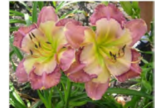
H. Cosmic Kaleidoscope