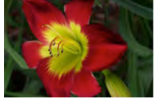
H. Christmas Is