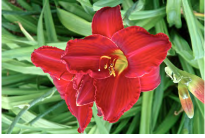
H. Holiday Happiness