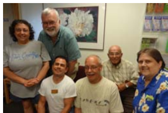
Successful WDS Hybridizers