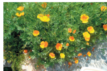
Those gorgeous California poppies line the sidewalk.