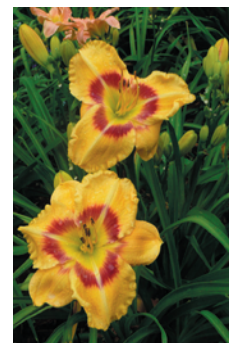
H. 'Lunar Max'