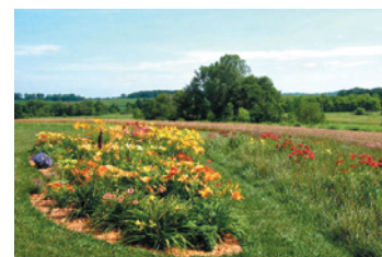
Left: Rita Thomas's garden held such a variety of plants and architectural features. Right: Windy Benz' garden overlooking a vast panorama.