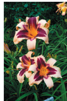
H. 'Wild Horses'

To attend the Annual Meeting, read, fill out, and mail in the Annual Meeting Reservation Sheet located on the last page of this Newsletter. YOU MUST SEND IN YOUR RESERVATION!!!!