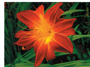
A polymerous H. 'Ruby Spider'

Most years in our garden 'Ruby Spider' will have one flower that has more than the usual three sepals and the corresponding three petals. In the past when this occurs the flower was called a polytepal. To conform to current botanical usage, AHS has adopted the term polymerous to refer to this phenomena. Often the polymerous flower on 'Ruby Spider' will have sets of 4 or 5 sepals and corresponding petals. You can imagine my surprise when I gazed upon 'Ruby Spider' with polymerous flower that had 6 sepals and 6 petals. The bloom was massive. Quickly I grabbed my camera, as this phenomena had to be recorded for garden posterity.