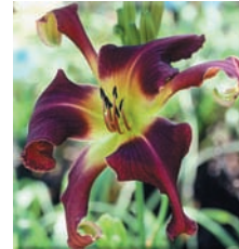
H. 'Twilight Tarantula'

To attend the Annual Meeting, please read, fill out, and mail in the Annual Meeting Response sheet located in this Issue of the WDS Newsletter. We must have your reservation by October 10th