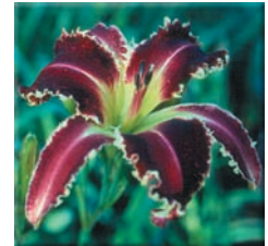
H. 'Eight Miles High'