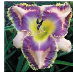
H. 'Highway Blues'