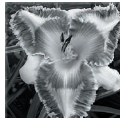
H. “Highway Blues”