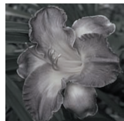
Below: H. 'Borg Technology'