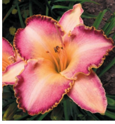
Phil’s introduction ‘Glory on High’