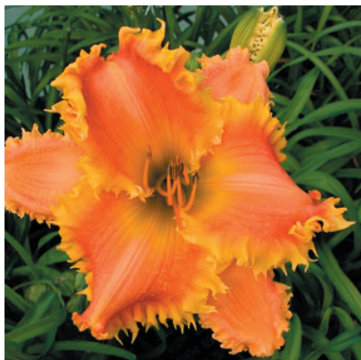
Above: H. 'Bass Gibson' Below: H. 'Beam Me Up'