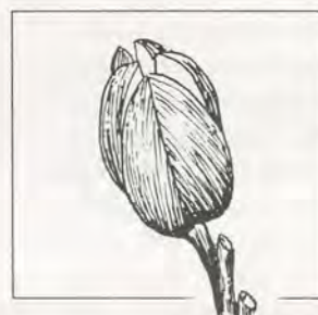
Pod Ready to Harvest

Managing Daylily Increase: divisions, seeds, proliferations Wednesday August 1 at 7:30, OBG - The joy of growing your favorite daylilies in the garden and landscape can be