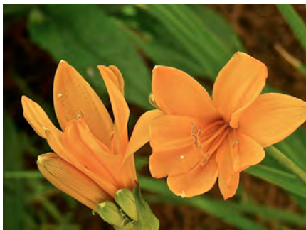
H. 'Dr Regel'