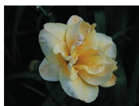
H. 'Precious Beginnings'