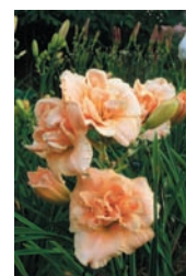
H. 'Peace on Earth'