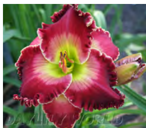
David's H. "Barbara Mandrell"